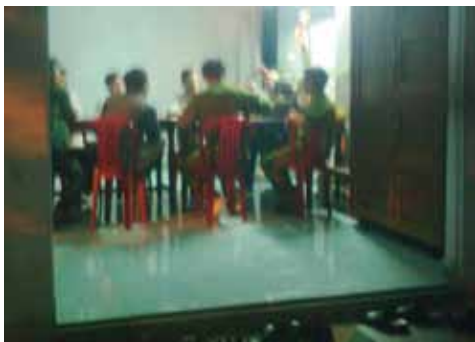
Police control identity papers at night in Giac Minh Pagoda.