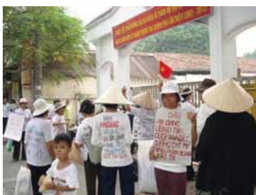
Peasants and farmers from An Giang province in southern Vietnam demonstrate outside the Government General Inspections Office in Hanoi.

In many cases, Police suppress peaceful protests with excessive violence. On 26 May 2010, a 12-year-old boy was shot dead and two others gravely wounded in Thanh Hoa Province when Police fired on villagers protesting inadequate compensation of their lands to build the Nghi Son Oil refinery, a six-billion dollar project. The villagers had tried to prevent trucks from unloading at the construction site, but had not engaged in violence or destroyed property 68 .