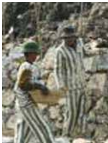
Prisoners perform hard labour in Z30A Xuan Loc camp.

Detention conditions in Vietnam's prisons and labour camps (a Vietnamese version of the Chinese Laogai ) are extremely harsh. Beatings and torture to obtain "confessions" are frequent. Prisons and camps are invariably overcrowded and filthy. Food rations are grossly insufficient, and prisoners rely entirely on supplies brought by their families, or vegetables they grow in the camps. Medical treatment is inadequate, and prison doctors are often simply inmates with no medical experience. Forced labour is obligatory, even in bad weather. Forms of torture include prolonged detention in solitary confinement cells with no windows or ventilation. Vietnam has made no effort to implement the recommendations made by the UN Working Group on Arbitrary Detention to improve prison conditions after their in situ visit to Vietnam 51 , and has ignored the Working Group's requests to make a follow-up visit.