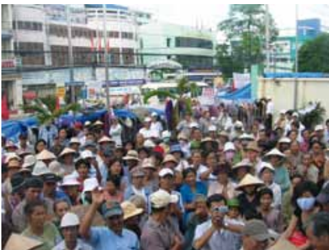
Peasants and farmers listening to Thich Quang Do. They had travelled from the countryside and camped outside the National Assembly for over three weeks to protest land confiscation and official power abuse.

“What can we do to bring stability, well-being and development to the people of Vietnam? During my long years in detention, I have thought deeply, and I have come to the conclusion that there is only one way – we must have true freedom and democracy in Vietnam. We must have pluralism, the right to hold free elections, to chose our own political system, to enjoy democratic freedoms – in brief, the right to shape our own future, and the destiny of our nation. Without democracy and pluralism, we cannot combat poverty and injustice, nor bring true development and progress to our people. Without democracy and pluralism, we cannot guarantee human rights, for human rights cannot be protected without the safeguards of democratic institutions and the rule of law” 48 .