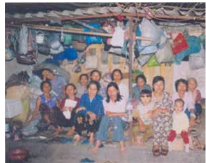
Women farmers and peasants (Dan Oan) live in make-shift shelters in Hanoi as they demonstrate for land rights.

Lack of implementation, lack of awareness, insufficient information, widespread official corruption, power abuse and the lack of an impartial judiciary result in mass abuses of women’s right to land. According to the UN Volunteers report, only 3% of Land Use Right Certificates are registered in women’s names, and 3% are jointly-held 98 . Due to traditional practices, women rarely inherit land or have any say over their parents’ land-use rights. This is in contravention to Vietnam’s international obligations as a State Party to the Convention on the Elimination of All Forms of Discrimination against Women (CEDAW), which requires the State to ensure the “ same rights for both spouses in respect of the ownership, acquisition, management, administration, enjoyment and disposition of property ” 99 .