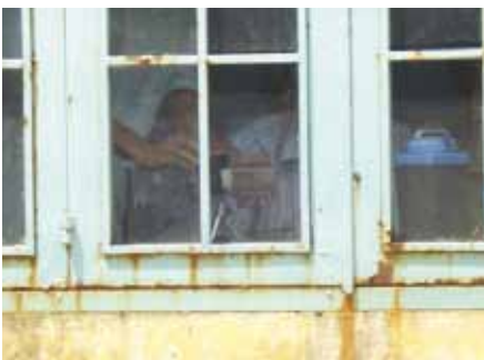
Security Police “secretly” film vesak celebrations at Giac Minh pagoda, Danang.

The Unified Buddhist Church of Vietnam: The situation of the Unified Buddhist Church of Vietnam (UBCV), adhered to by the majority of the Vietnamese population, is of particular concern. Banned effectively in 1981 following the creation of the State-sponsored Vietnam Buddhist Church, it is a constant target of repression. Despite repeated appeals from the international community, Vietnam has made no move to re-establish the UBCV’s legal status, and continues to harass and threaten its members.