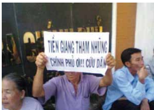
"Tien Giang officials are corrupt. Please will the government save the people". Rural people from the South stage anti-corruption demonstration in Hanoi.

Economic liberalisation under one-Party control, without the safeguards of a free press and independent judiciary, has fostered endemic corruption which has permeated all echelons of the Party and state. According to the official press, corruption has reached the proportions of a “national catastrophe”, with up to 40% of public funds “disappearing” each year through corruption and graft. Not only is corruption growing, but it is also “becoming more sophisticated” 102 as international aid pours into the country - Vietnam receives five billion US dollars per year in development aid and loans from the international community 103 . In December 2008, Japan temporarily