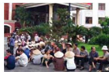
Peasants and farmers gather outside government buildings to file complaints.

“Communist Party cadres are all rotten and corrupt. They have turned the Party into a “devil”, and made the people suffer. In brief, the Communist regime is completely rotten. Today, the people endure terrible injustice, all over the country Party cadres make the people suffer. As a member of the Communist