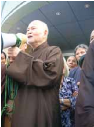
Thich Quang Do speaks to peasants and farmers demonstrating outside the National Assembly's Southern Office in July 2007.

From house arrest at the Thanh Minh Zen Monastery in Ho Chi Minh City, he has continued to speak out for social justice and freedom in Vietnam, and express solidarity with Buddhists in Burma and Tibet. His “Appeal for Democracy” (2001) won signatures from over 300,000 Vietnamese and international personalities. He has also launched appeals on social and environmental issues, calling for an end to Bauxite mining (2009) and even escaping house arrest to distribute relief aid and address a demonstration of “Victims of Injustice” outside the National Assembly’s southern office (2007). In 2005, in a recorded message sent clandestinely to the United Nations Commission on Human Rights in Geneva, he stressed that economic development was untenable without human rights and democracy: