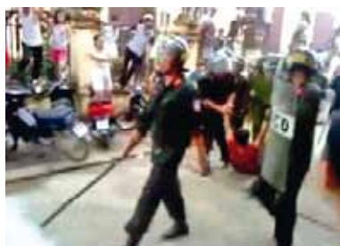
Riot Police confront demonstrators in Bac Giang on 25.7.2010.