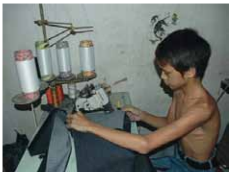
Child laborers are forced to work up to 16 hours a day at some garment factories in Ho Chi Minh City.