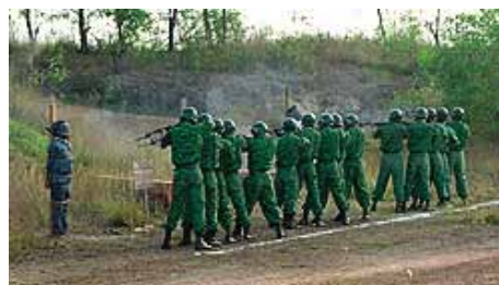
Execution by firing squad in Vietnam.

The use of the death penalty is frequent in the Socialist Republic of Vietnam. In 2009, the government reduced the number of offences punishable by death from 29 to 22. Capital punishment is applied for crimes including murder, armed robbery, drug trafficking, rape, sexual abuse of children, and a range of economic crimes. Execution is by firing squad. A draft law was introduced in November 2009 proposing the use of two methods of execution, either by firing squad or by lethal injection.