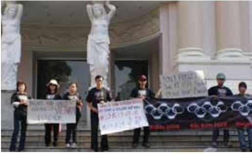
Students demonstrating against China.