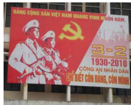
Poster celebrating 80 th Anniversary of the Communist Party of Vietnam. Under the heading “Long live the glorious Communist Party of Vietnam”, it reads: “Only the Party and the Police count”. This contrasts with late President Ho Chi Minh’s motto: “The Security Police are the servants of the people”.

The precinct security warden is responsible for delivering - or confiscating – the ho khau. People applying for the permit must provide a ly lich , or curriculum vitae , which contains details of every person in one’s family, their religion and political background. Vietnam is one of the few countries in the world to maintain this system of registration permits. Political and religious dissidents are routinely refused residency permits after their release from prison, and they live in a state of permanent insecurity. The ho khau is becoming an increasing problem as rural populations are expelled from their lands and seek work in the big cities. Because they have no ho khau, their children are not registered. As a result, there are millions of people in Vietnam today who do not legally exist and are totally deprived of their basic rights.