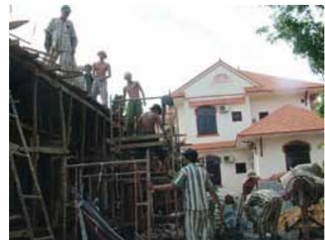
Prisoners from Xuan Loc camp working on constructions outside the prison.