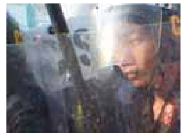
Police quell demonstrations in Con Dau.