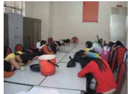
Young women to be sold as brides to Malaysia, South Korea and Taiwan.

Sex rings offering “women for rent” in which women and girls are subjected to intensely cruel treatment is a “new form of business”, according to Lt.-colonel Pham Van Dem of the Border Police Political Department. The girls are held in total secrecy and rented on a monthly basis to brothels or bars, where they are exploited to a maximum. When they have lost their health and beauty, they are classified as “out-of-date”. The pimps then traffic them across the Chinese border and sell them to poor men in remote regions who cannot afford a wife, and who pool money together to “share” a woman for sexual services and child-bearing. The women live in atrocious conditions, permanently locked up and beaten cruelly. “Girls who try to run away have their tendons cut to prevent them from walking. Those who manage to escape are traumatized and permanently deranged”. 88