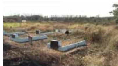
Cemetery for executed prisoners next to an execution field in the suburbs of Ho Chi Minh City.

One execution field, just 20 km. outside Ho Chi Minh City, is situated next to the new buildings of Ho Chi Minh City’s French school ( Ecole Française ). The Vietnamese authorities promised French Prime Minister François Fillon during his official visit in November 2009 that executions would be stopped before the school children moved in. However, executions are continuing on the site, reportedly at the rate of two sessions per month (with possibly more than one prisoner executed each time). In March 2010, parents saw offerings placed on the site by the families of executed prisoners 65 .