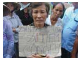
The people of Soc Trang province seek justice” – demonstration by “Victims of Injustice” (Dan Oan) against land confiscation.

Although the right to assembly is guaranteed by the Constitution (Article 69), Vietnam systematically suppresses peaceful demonstrations and punishes protesters under criminal law. In 2008, scores of students and demonstrators were arrested after Police forcefully disbanded peaceful protests against Chinese claims of sovereignty over the Spratley and Paracel Islands and Vietnamese sea and land territories. Many are currently serving prison sentences.