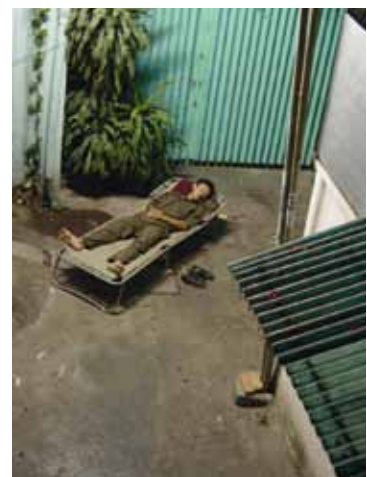
Security Police camp day and night outside the UBCV's Giac Hoa pagoda in Ho Chi Minh City.

In July 2008, the UBCV's Fourth Supreme Patriarch and prominent human rights defender Thich Huyen Quang died under house arrest at the Nguyen Thieu Monastery in Binh Dinh. After subjecting Thich Huyen Quang to over 30 years in detention and isolation at various times throughout his life, Vietnam's leaders sought to draw political capital from his death by insisting that his funeral be organised by the state-sponsored Vietnam Buddhist Church. At the same time, the state-controlled media ran a vitriolic campaign to discredit the UBCV's No. 2 dignitary Thich Quang Do, accusing him and " other extremist elements disguised as Buddhist monks " of trying to turn the funeral into an " anti-government rally ". Thich Quang Do refused to give in, and following strong international protests, the funeral was held under UBCV auspices. Over 10,000 UBCV Buddhist monks, nuns and followers braved Police intimidation and blockades to attend the Patriarch's funeral on 11 July 2008 in Binh Dinh.